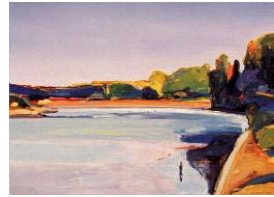
A View from Jim's Bridge

NOTE: Posters and Lithographs are 23 ¼” x 19 ½”, including white border. Lithographs are signed and numbered. Posters only contain the words: “American River Parkway Foundation” below the image.