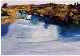
Summer Day – American River